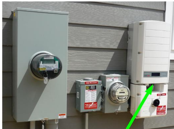
Button located here

NOTE: This must be completed during the day.